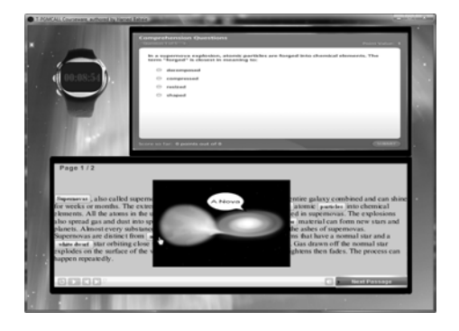
In Picto-Textual-Gloss Multimedia Courseware, both the pictorial and textual definitions were presented to the subjects.