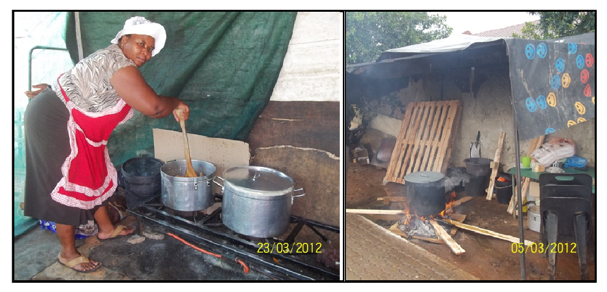
Figure 4. Images of informal business premises, Alexandra Township, Johannesburg

A majority 73.3% of the sampled businesses had one to two workers, often made up of the owner and one employee or just the owner working alone. About 34.5% of the businesses earned over R1500 per week with a maximum of R7000 and a minimum of R400. Around 45.5% of the businesses operated on open-road spaces (free occupation) with an equal number operating on rented premises (average monthly rent R270). The open-road premises consisted of a makeshift structure made up of a canvas canopy supported by four poles and no walls (Figure 4). Some of the entrepreneurs operating on the makeshift structure rented stores for overnight storage of their valuables at R150 per month.