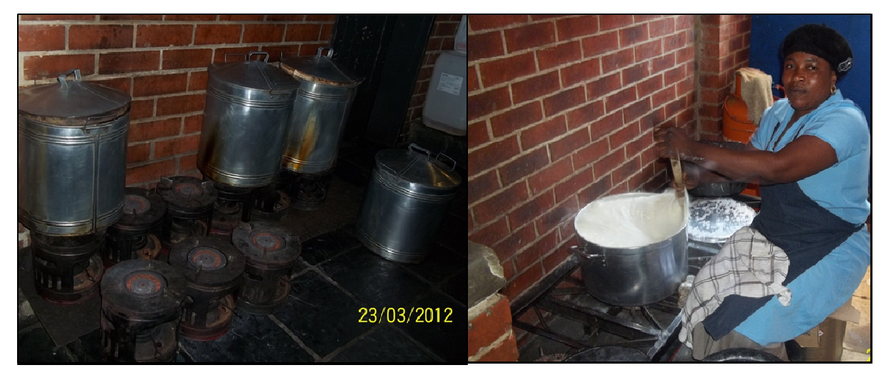
Figure 2. Paraffin and gas cooking in Alexandra Township

Among enterprises using LPG, three or four-burner stoves were most common, where they were often deployed alongside paraffin stoves; the latter being used for heat-intensive tasks (e.g. boiling water) that are more cost-effectively done with paraffin rather than LPG. The busier enterprises used up to ten paraffin stoves and two four-burner LPG stoves (Figure 2).