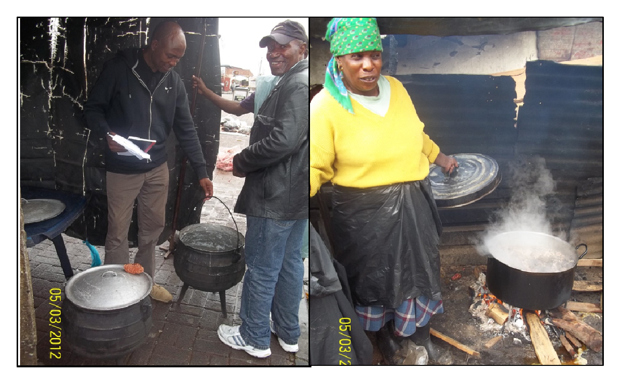
Figure 1. Image of regular cast iron pot and commercial cooking on three-stone wood fire

Among enterprises using LPG, three or four-burner stoves were most common, where they were often deployed alongside paraffin stoves; the latter being used for heat-intensive tasks (e.g. boiling water) that are more cost-effectively done with paraffin rather than LPG. The busier enterprises used up to ten paraffin stoves and two four-burner LPG stoves (Figure 2).