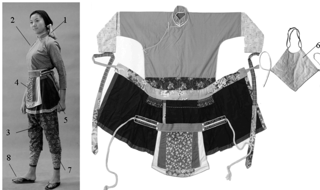
Figure 1. A Complete Set of Clothing for Women in Jiangnan Watery Region