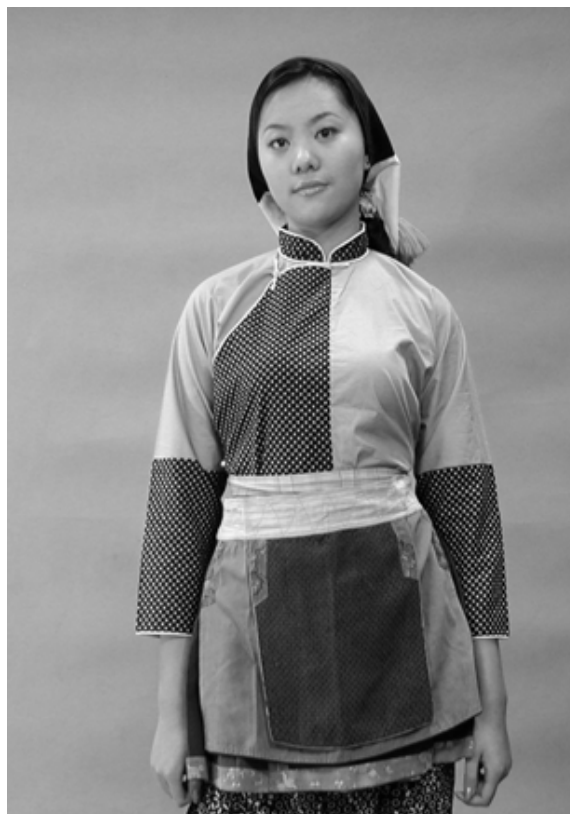
Figure 4. Local Women's Blouse