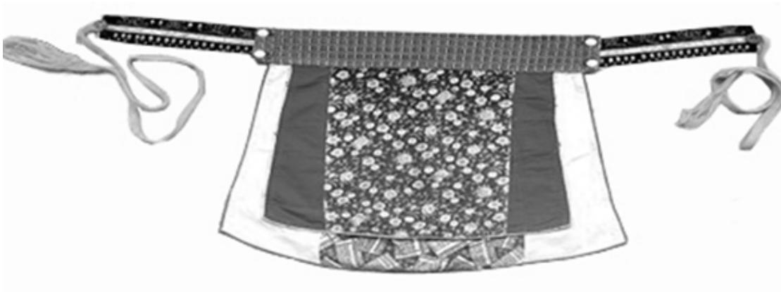
Figure 6. Local Women's Waist-skirt