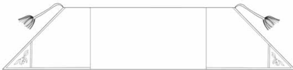
Figure 3. Structure of the Local Head Scarf