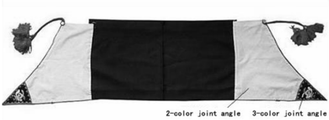
Figure 2. Local Women's Head Scarf