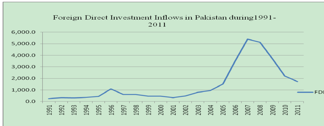
Figure 1. Pakistan FDI inflow during the period 1991-2011

Source: SBP, Handbook of Statistics on Pakistan Economy, 2011 p.556.