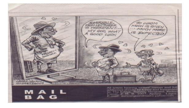
Figure 1. Depicts democratic leadership, Vanguard, July 20, 2010

Figure 1 refers to president Goodluck, who is depicted ostentatiously in a mood of self reflection. He was standing in front of an enormous dressing mirror smiling too widely in admiration of his mirror image, living behind his briefcase. He was specifically amazed with his bulging stomach by holding it with both hands as a sign of affluence. The point of reflection was his sudden rise from the post of a lecturer to an incumbent president. Immediately behind him is a terribly emaciated beggar with cross sign on his head, carrying a big begging bowl. The beggar, wearing worn-out dresses tagged "masses" spreading his hand to beg for sustenance, but the president appears completely oblivious about him.