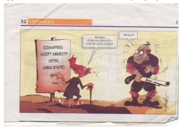
Figure 5. Depicts insecurity in Nigeria, Daily Trust, March 9, 2009

Figure 5 depicts the act of kidnapping people especially foreign workers from oil companies and other prominent individuals in Niger Delta area as another heinous crime related to the theme of insecurity. The rate at which people are continuously kidnapped inflicts fear and sense of insecurity to people.