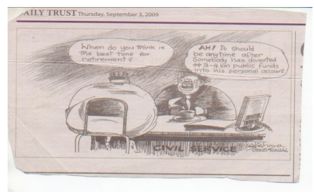
Figure 2. Depicts corruption Daily Trust, September 3, 2009

are turned into something else like a dining room. The displayed cup, saucer and teaspoon have turned an official writing desk into tea table and this indicate how public facilities are personalized which is an act of appropriation. Similarly, the obese nature of the two officers reveals that they live above their legitimate earnings.