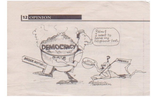
Figure 6. Ddepicts foreign policy, Daily Trust, December 23, 2007

The denotation of this cartoon (Figure 6) refers to the late president depicted on transit carrying a huge container full of cooked food labeled "Democracy" heading to Niger republic as indicated by the signboard. On the far side is a pictorial image of a pauper who fell flat on the bare ground, holding an empty begging bowl with one hand and the national flag with the other hand. The pauper was looking keenly at the food. Furthermore, he is implicitly begging for the food by his body gesture, though not sure whether he will get his share. The president is aware of the pauper's condition but assured him that he has to serve his neighbor first.