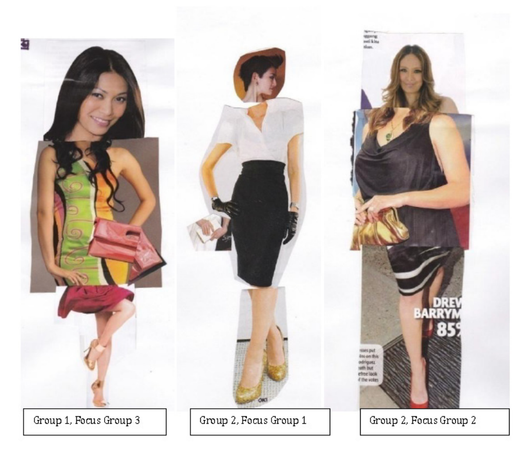
Figure 4. Examples of formula feeding collages – Small bags and high heels