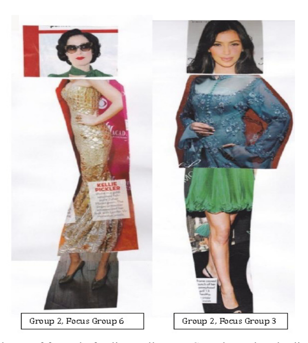
Figure 5. Examples of collages of formula feeding collages – Sexy hourglass bodies and tight fitting clothes