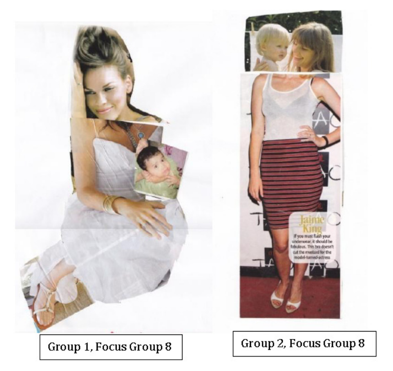
Figure 9. Breastfeeding collages showing mother and baby