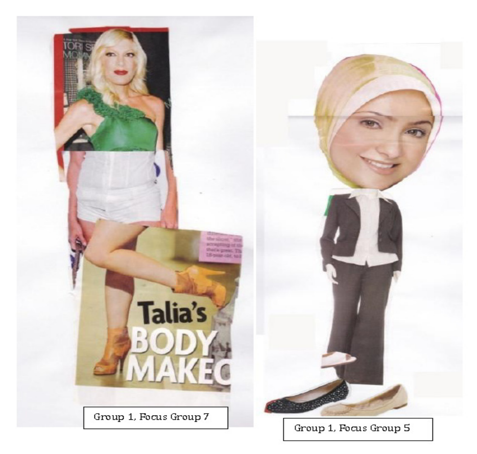
Figure 8. Western vs. hijabi/Malay looking women – Examples of formula feeding (left) and breastfeeding (right) collages