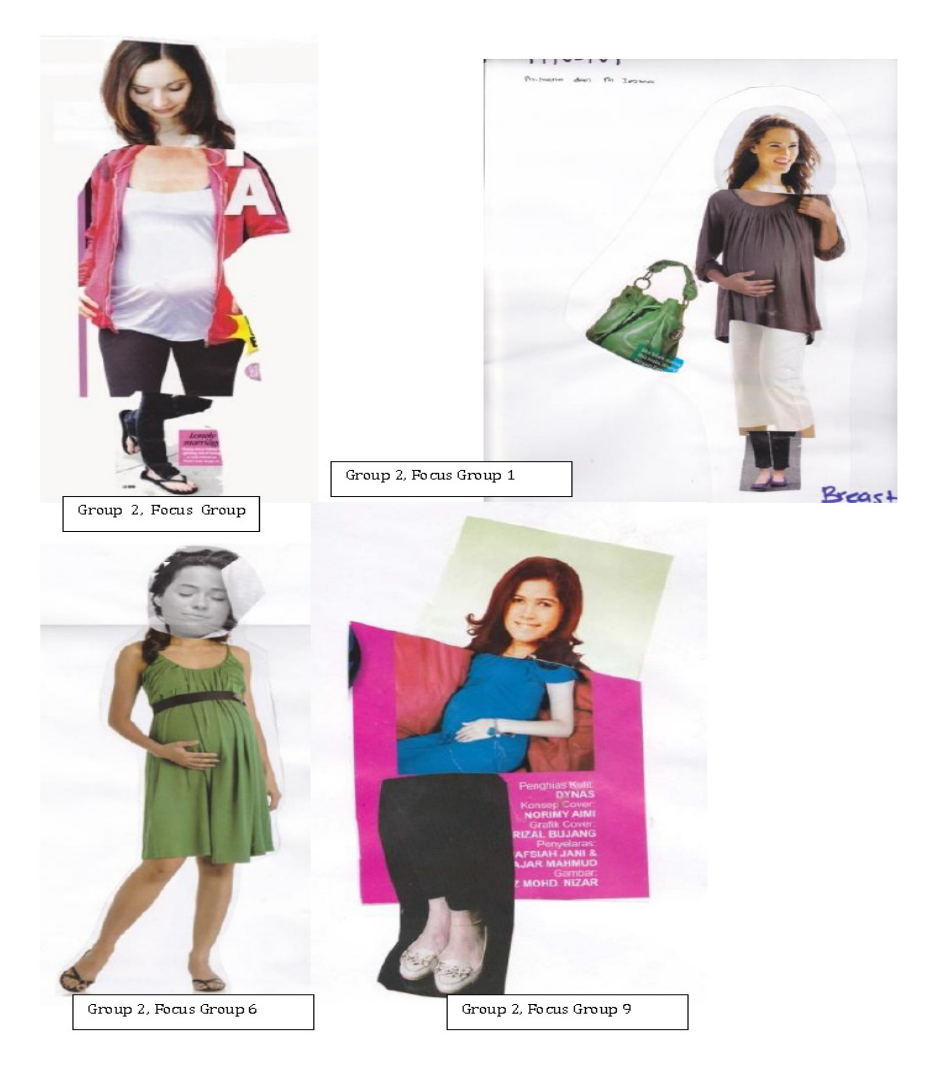
Figure 6. Examples of breastfeeding collages – Pregnant bodies