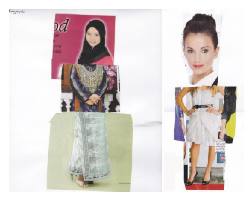
Figure 2. An example of traditional look for Malay breastfeeding woman (left) vs. Modern look for formula feeding Malay woman (right) constructed by Group 1, Focus Group 9