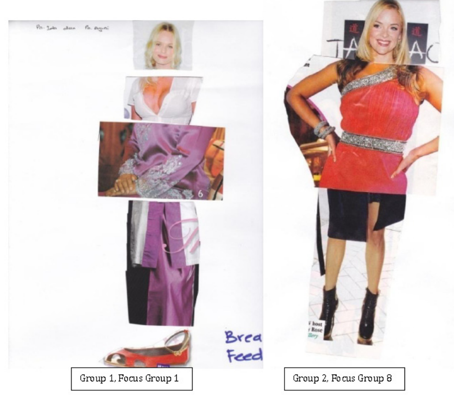
Figure 7. Examples of Big Breasts - Breastfeeding collage (left) and Formula Feeding collage (right)