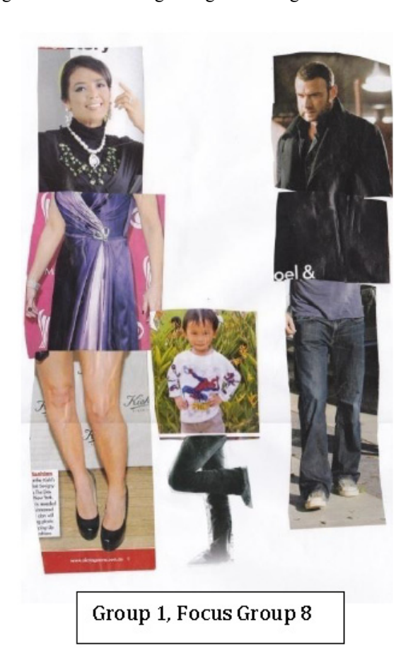
Figure 10. A Formula feeding collage including a child and a father figure