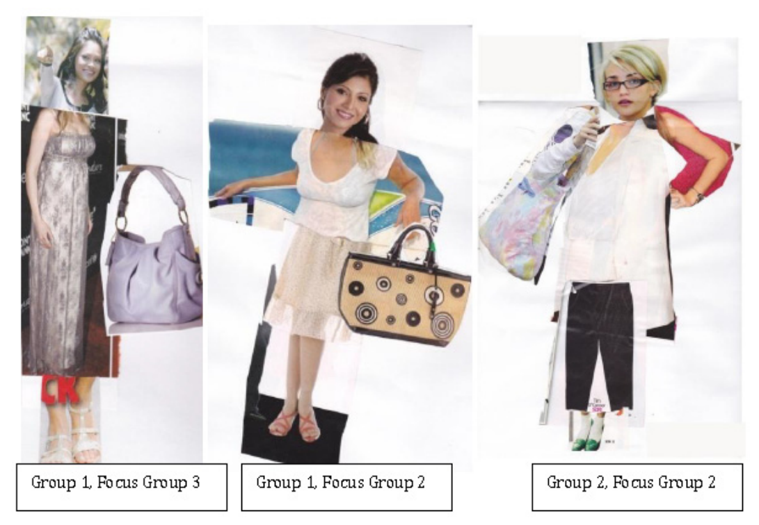
Figure 3. Example of breastfeeding collages - Large bags and flat shoes