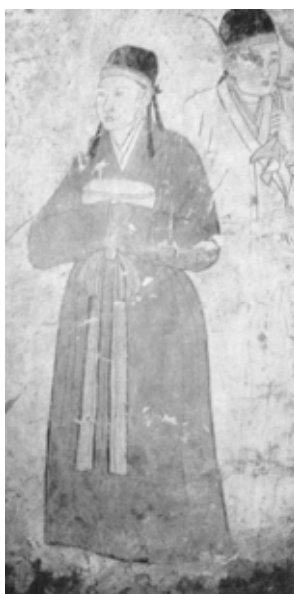
Figure 3. Mural Painting from Kulun Banner, Inner Mongolia