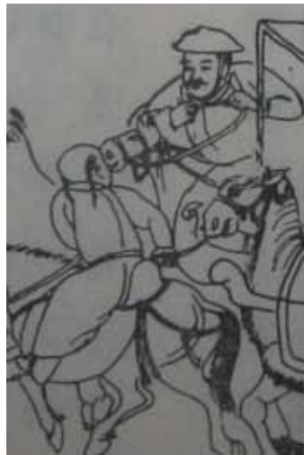
Figure 6. Part of the Study Sketch of mural painting from Xiao Yi Tomb,Yemaotai,Liaoning