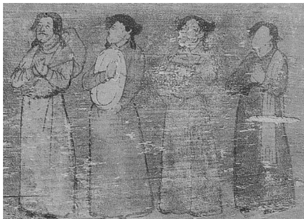
Figure 4. Part of a painting on the board, Wuwei, Gansu