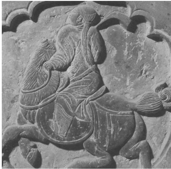
Figure 5. Tile carving from Dong Hai Tomb,Houma,Shanxi