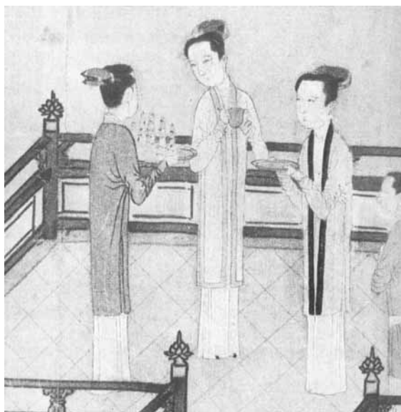
Figure 1. Part of a scroll ‘painting Yao Tai Bu Yue’ attributed to a Song painter