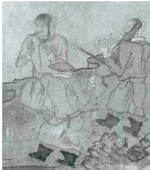
Figure 7. Part of a scroll painting 'Avalokitesvara' excavated from Heishuicheng, E'ji'naqi, Inner Mongolia