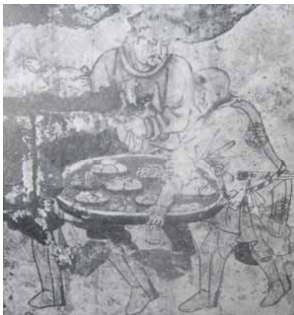
Figure 2. Drawing of a tomb mural from Dishuihu, Balinzuoqi, Inner Mongolia