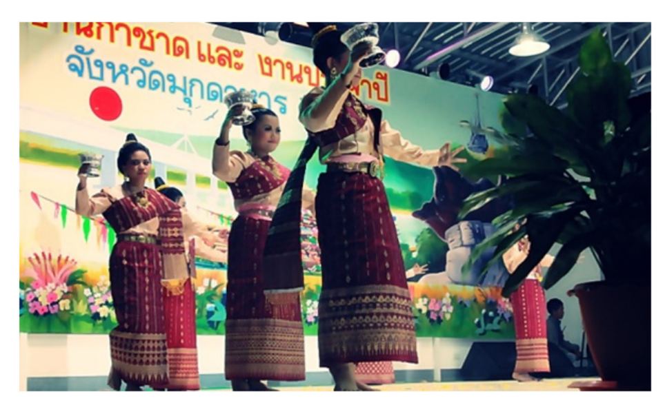
Figure 4. Results of choreography teaching to upper secondary level students in Mukdahan Province