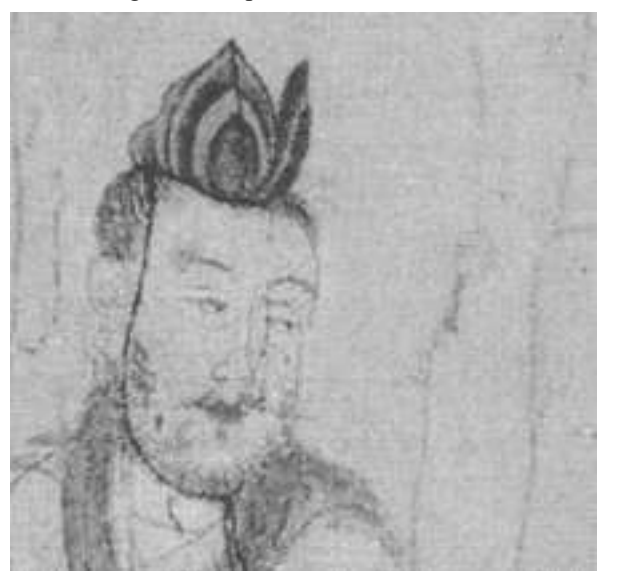
Figure 4. Three men's deerskin hats