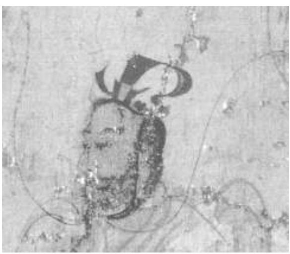
Figure 3. Emperor Yuan of Han's hat