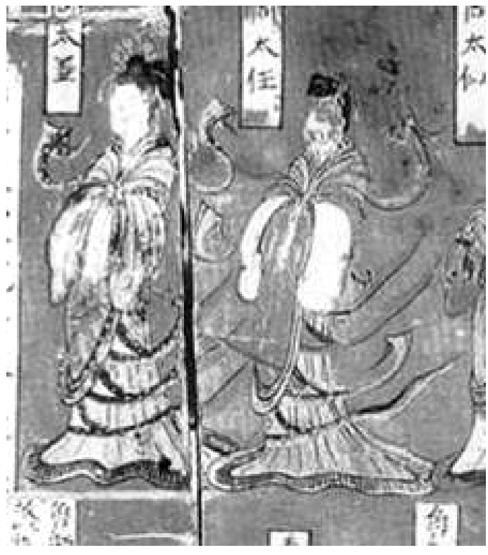
Figure 11. Lacquer painting in Datong Sima Jinlong Tomb