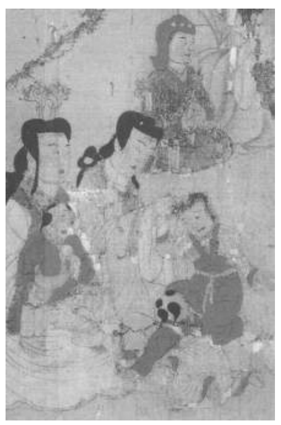
Figure 13. Children's silhouettes in 'Nushi zhen'