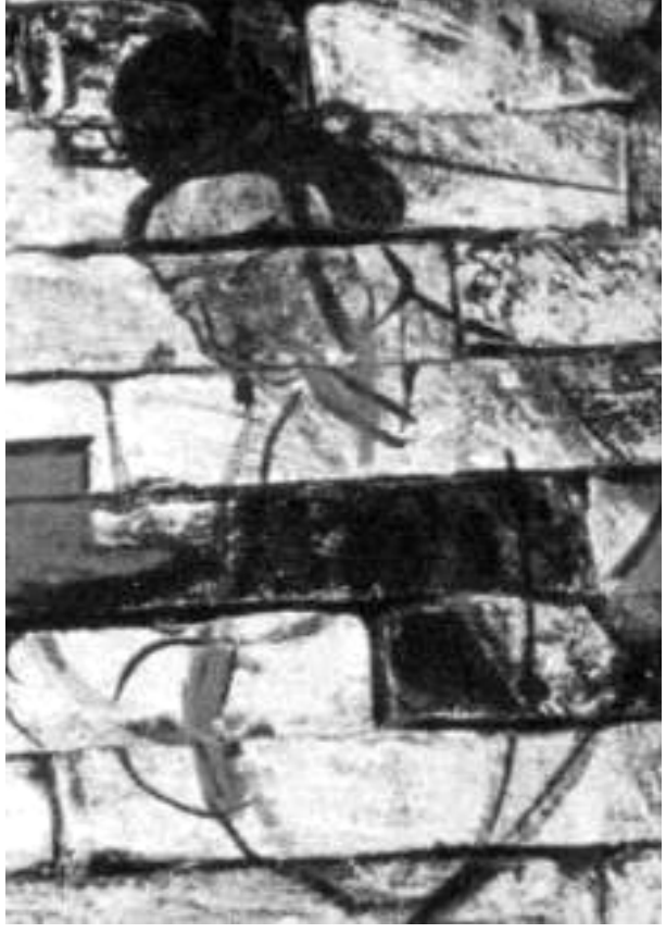
Figure 7. Figure brick in a tomb of Han Dynasty