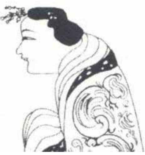
Figure 2. Lady's head ornaments and the hairstyle in silk painting of Mawangdui