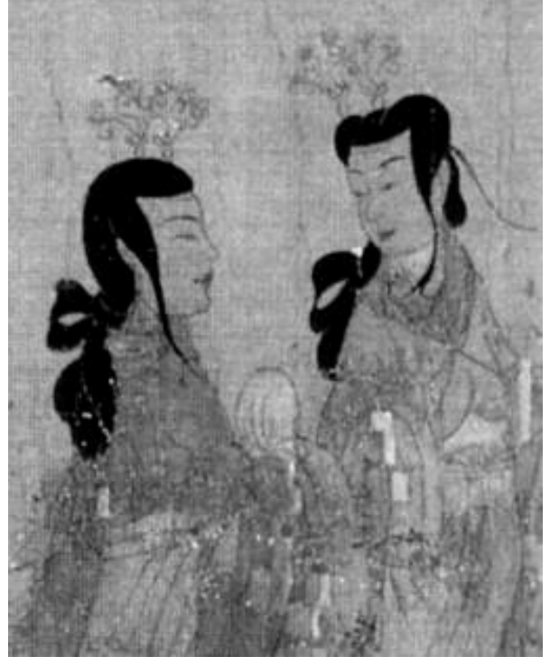
Figure 6. Another kind of hairstyle in 'Nushi zhen'