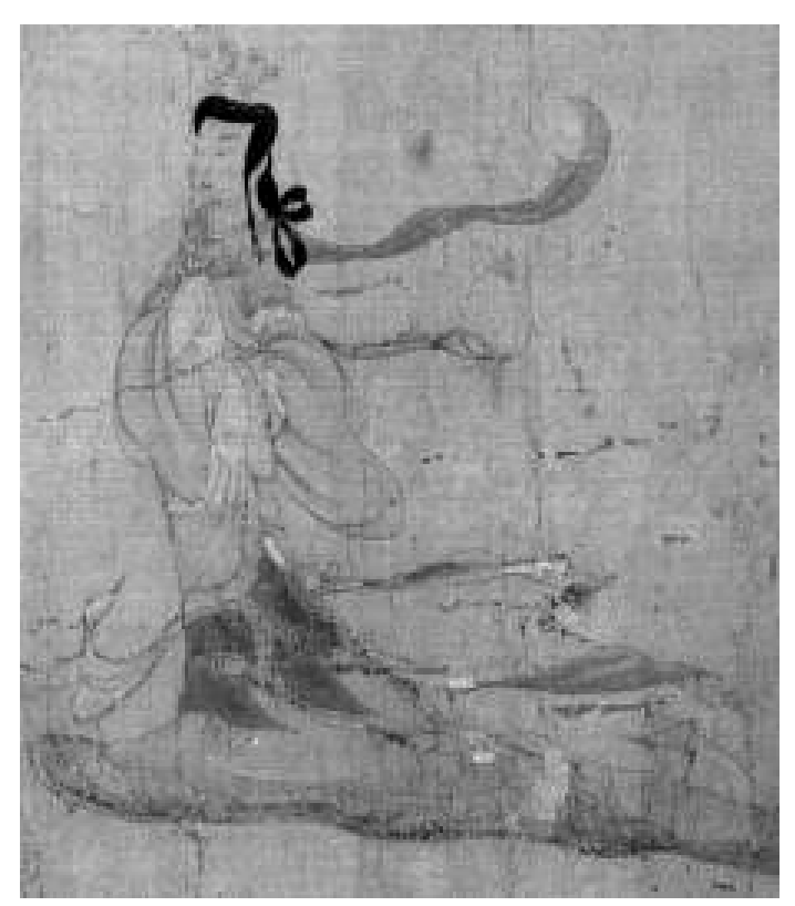
Figure 10. Lady's silhouette in 'Nushi zhen'