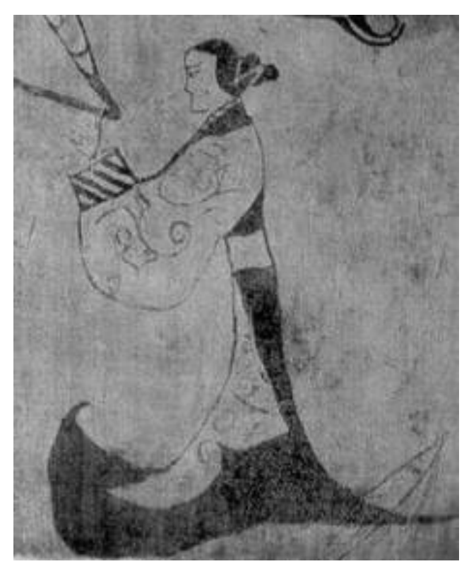
Figure 9. Lady's silhouette in the silk painting of Eastern Zhou Dynasty