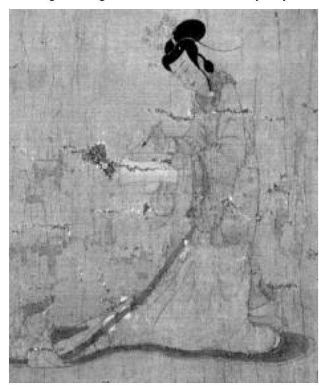
Figure 8. Lady's silhouette in 'Nushi zhen'