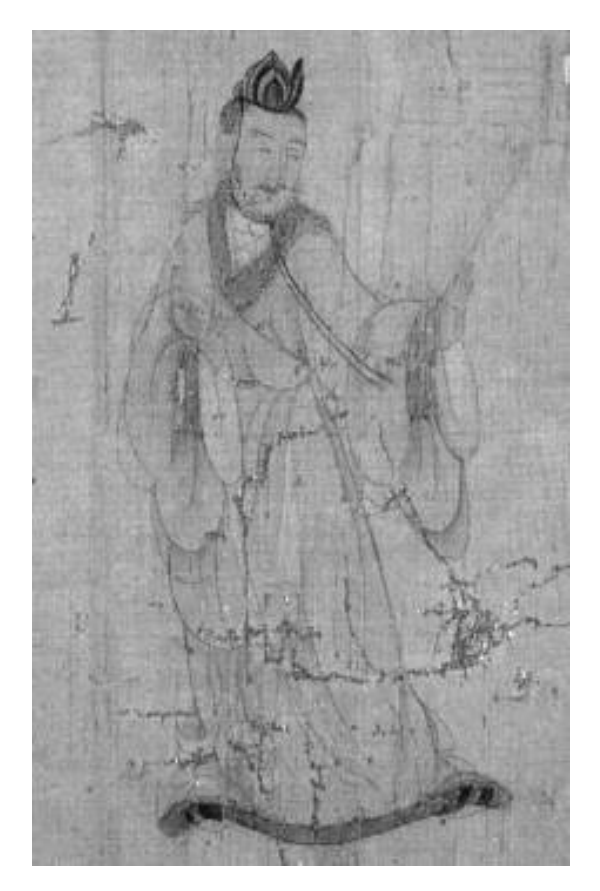
Figure 12. Man's silhouette in 'Nushi zhen'