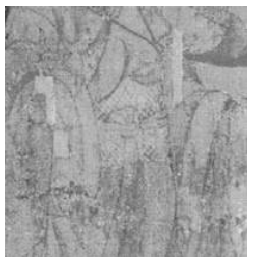
Figure 14. Lady's waist part in 'Nushi zhen'