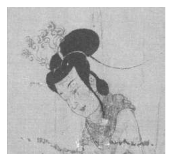
Figure 1. Lady's head ornaments and the hairstyle in 'Nushi zhen'

Zhang, Yanyuan. (1963). The Records & Commentaries on Historical Famous Paintings . Beijing: People's Fine Arts Publishing House, pp.23.